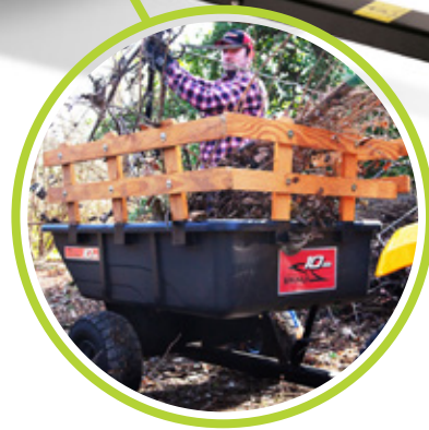
STAKE SIDE KIT FITTED